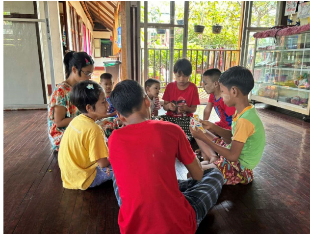
Photo of Mother House children playing UNO during their summer school break