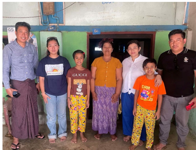
Photo of our MAM team reintegrating the children with their caregivers at their home