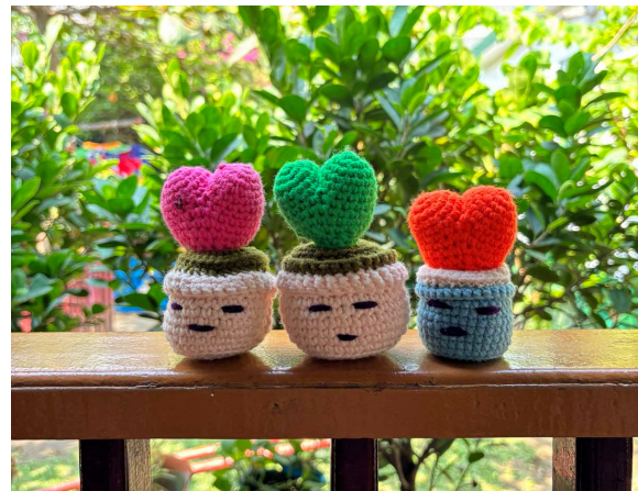
Photos Mother House children and the toys they made from crocheting