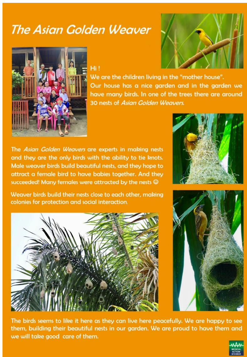
The bird nest poster from the Mother House