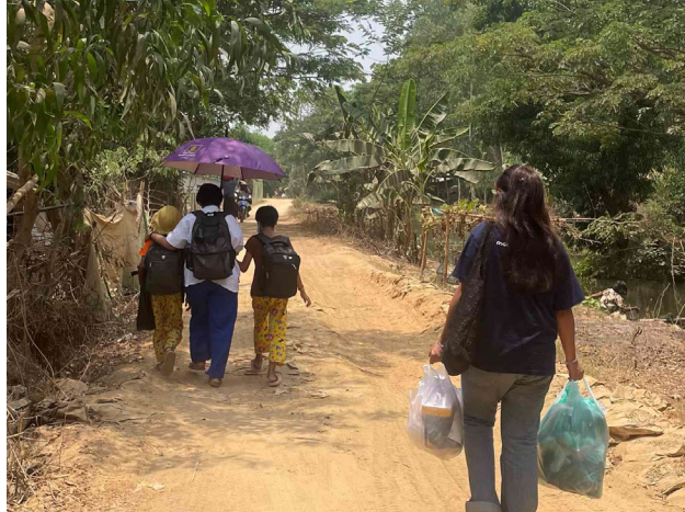
Photo of our MAM team and the children on their way to the children's house on reintegration day