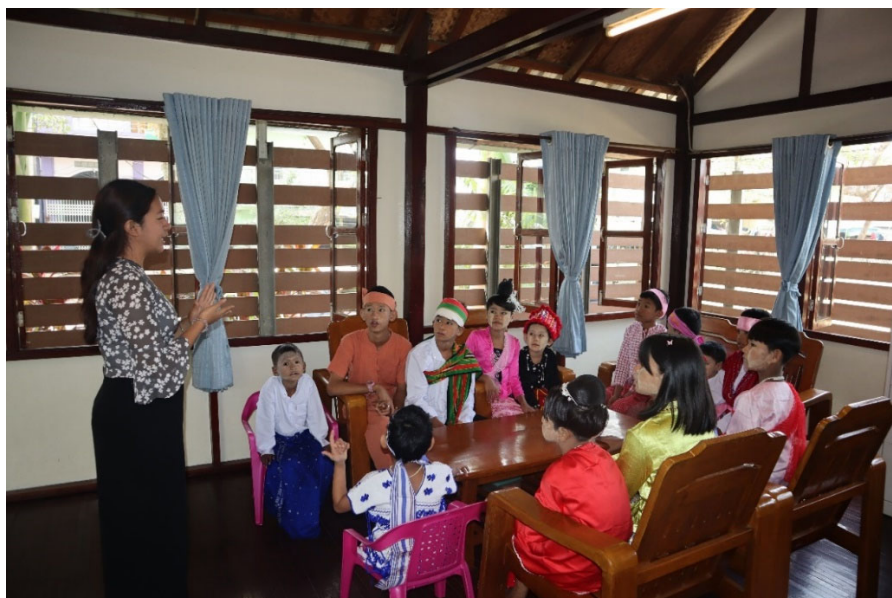
Photo of one of our social workers introducing the Mother Language Day to the Mother House children