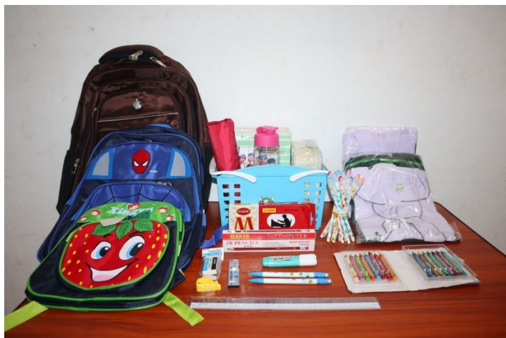
Photo of school supplies from the yearly back-to-school support, including age-appropriate backpacks