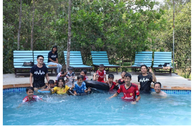
Photos of Mother House children during their excursion