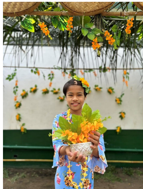
Photos of Mother House Pre Thingyan festival